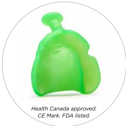
Health Canada approved. CE Mark. FDA listed.

All Whip Mix resins are qualified with Asiga 3D printers. Qualifying the resins with other open-source printers is an ongoing process. Call to check on your printer's status.