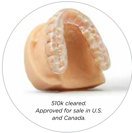
510k cleared. Approved for sale in U.S. and Canada.